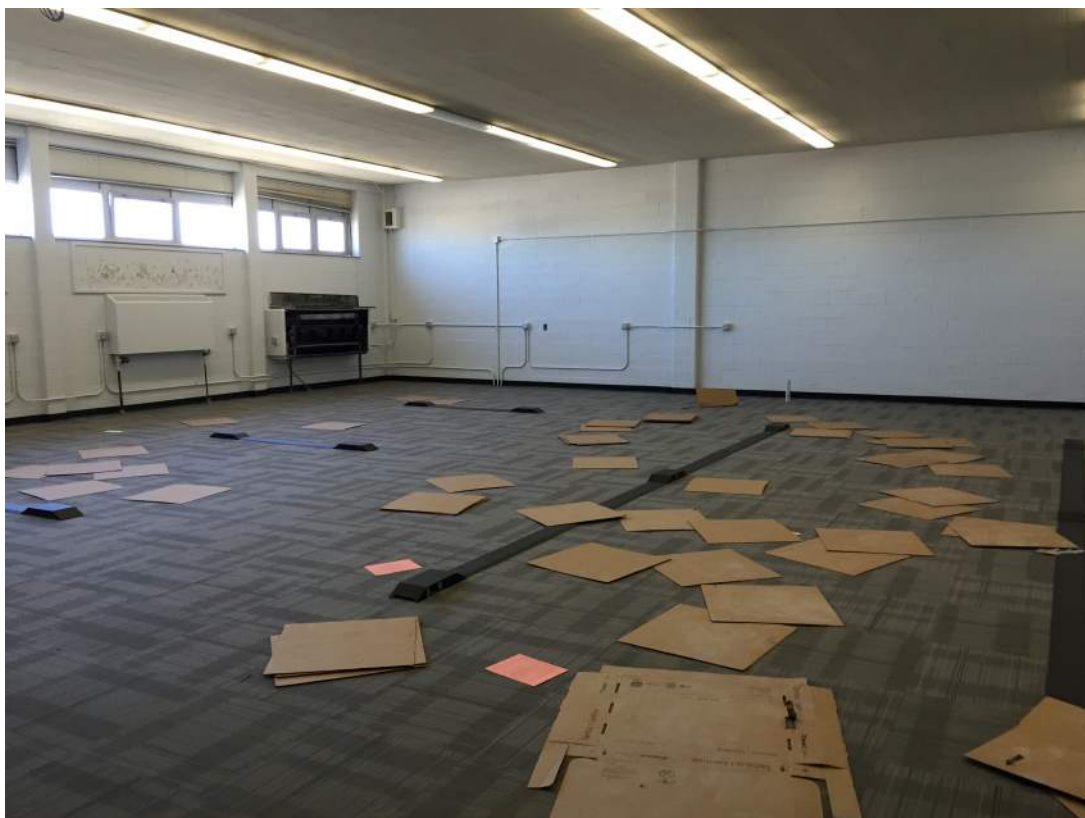
Band Room Turned Teacher Work Room