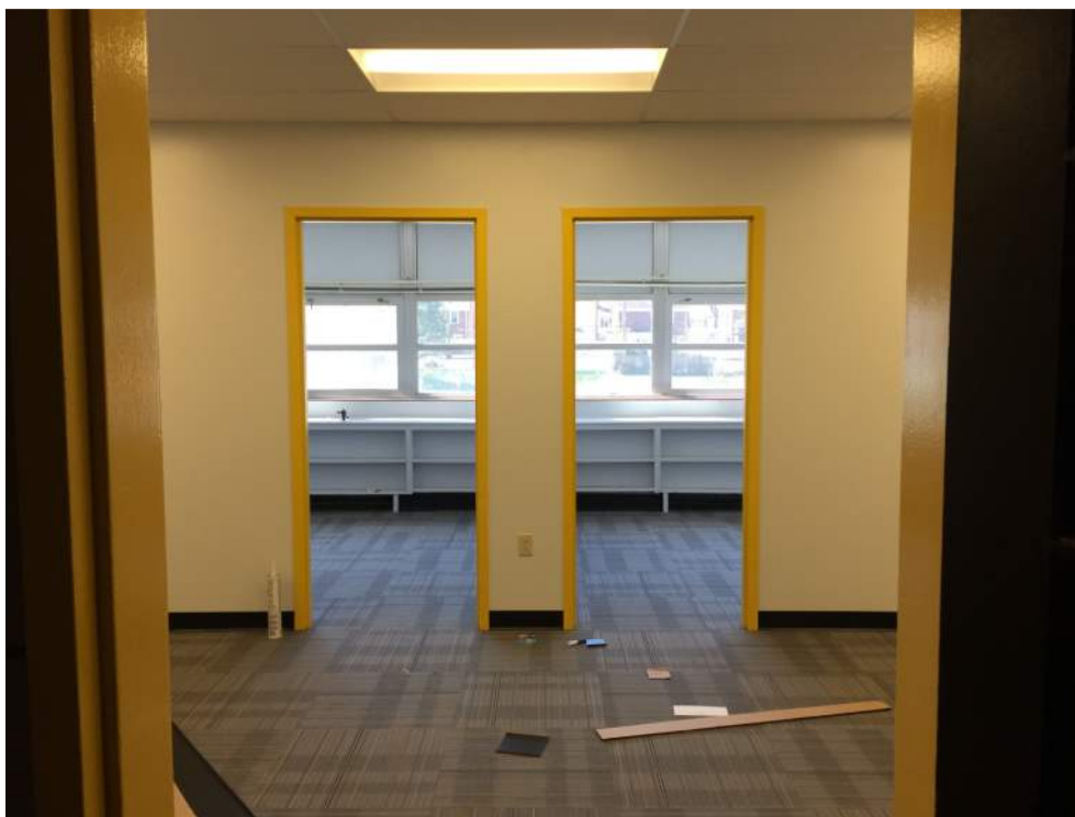
New Classroom Spaces

The work is being structured to receive furniture and technology devices beginning 8JUN2015.